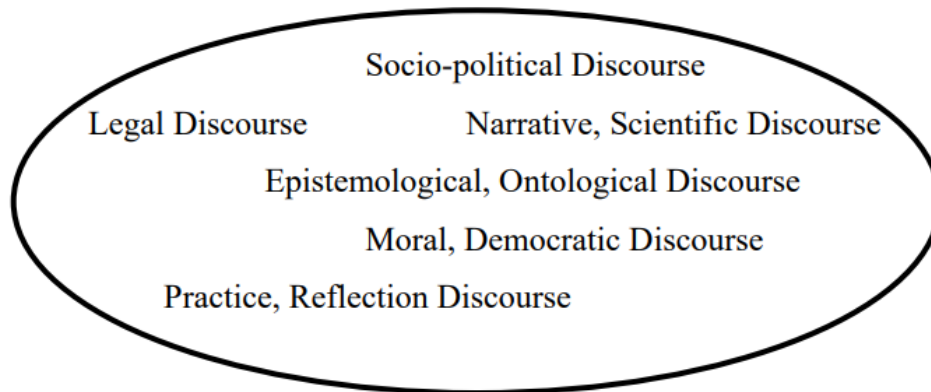
Figure 2. Educational public sphere

they are autonomous, voluntary, inclusive networks of communication; formed in response to legitimation deficits; grounded in ordinary language, communicative freedom, and mutual respect; and they generate indirect influence on public systems through social networks. For teacher education, these characteristics highlight the importance of non-coercive dialogue, autonomy, and the role of communication in professional learning. Conceptualizing pre-service teachers' work within public spheres situates classroom and school issues within broader social, economic, and cultural contexts. In this way, teacher education becomes both a site of discourse and a bridge linking educational practice with wider democratic and societal concerns.